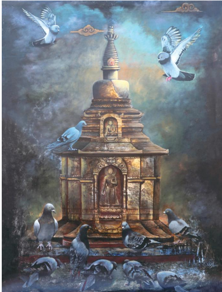
Essence of Nepal 36" X 48" Acrylic on Canvas 2022