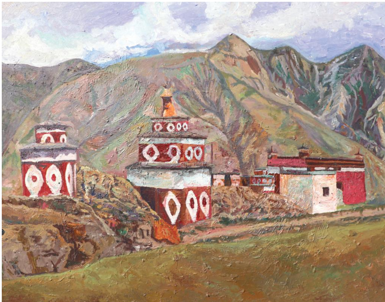
Heaven on the Earth "Mustang"