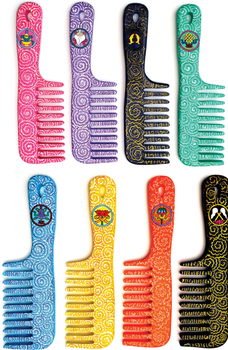
Astamangal series | Acrylic on Wood | 6.5 x 24 x 1.25 inch