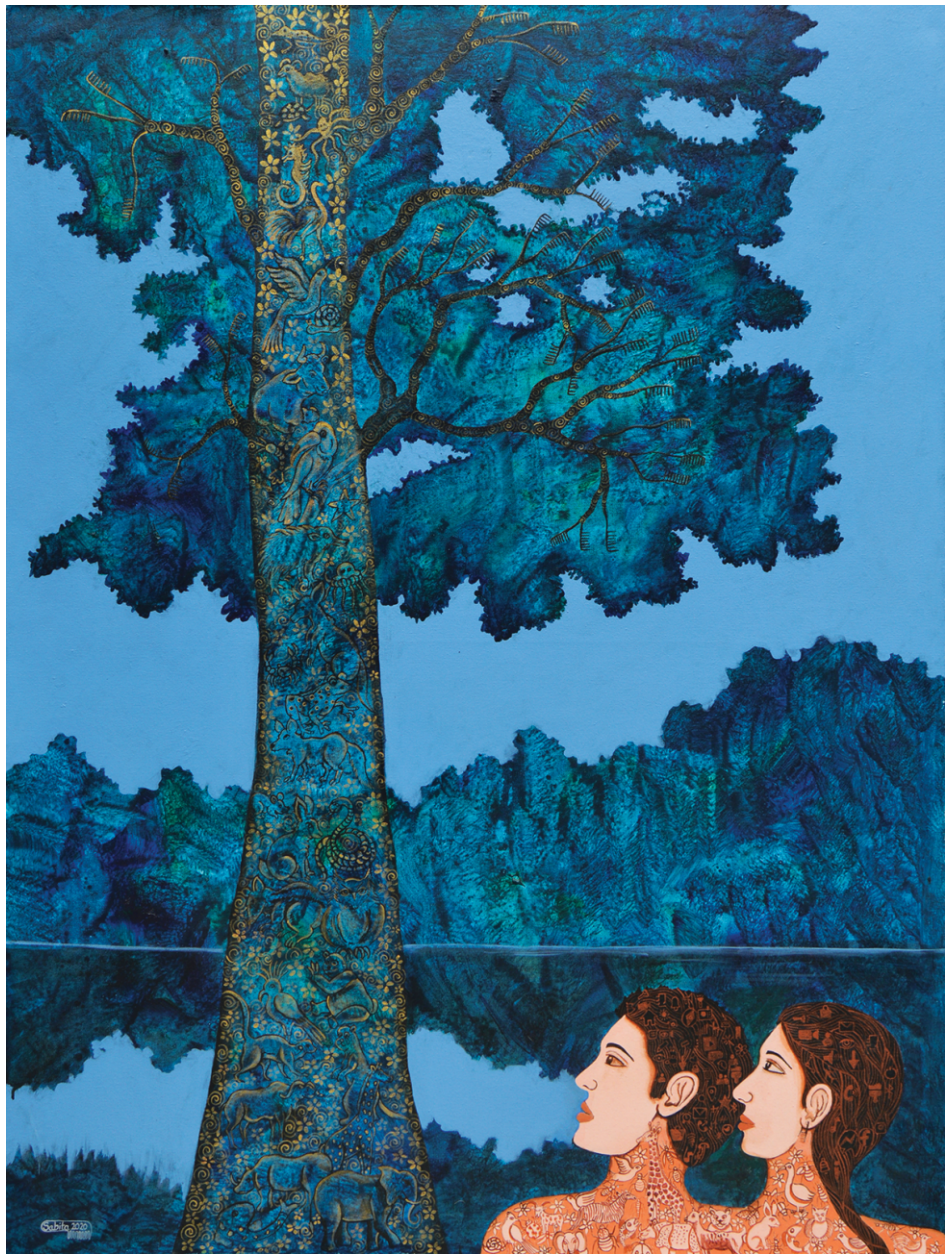
Salient essence Acrylic on canvas 36 x 48 inch