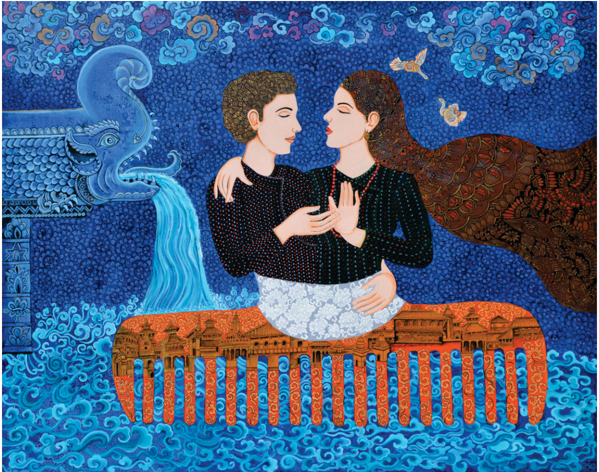
Inclination of souls | Acrylic on canvas | 48 x 60 inch