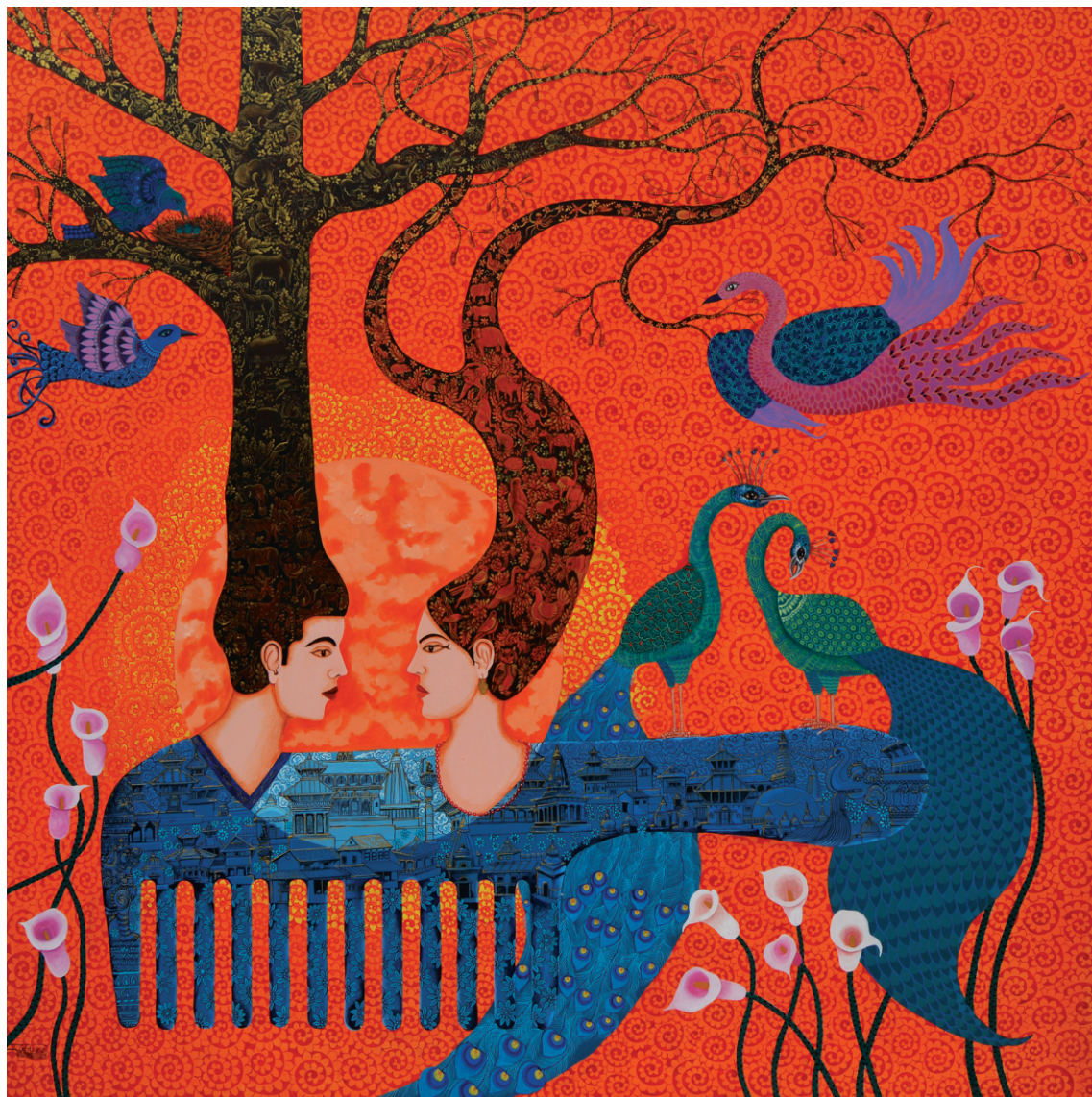
Tranquility of innovation and nature | Acrylic on canvas | 72 x 72 inch