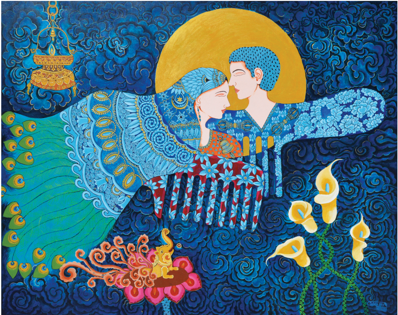
Eagerness of time | Acrylic on canvas | 48 x 60 inch