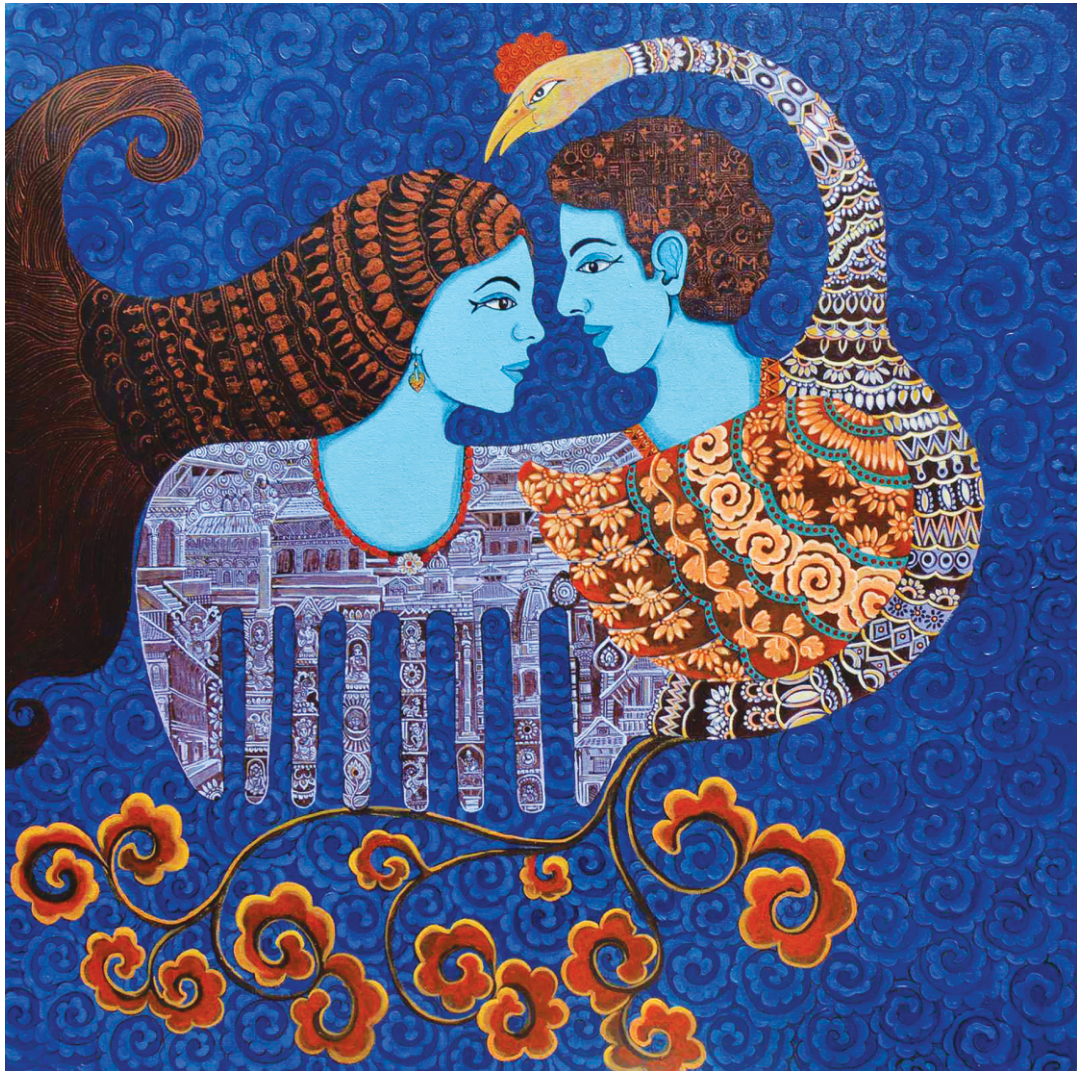
Protective shelter | Acrylic on canvas | 36 x 36 inch