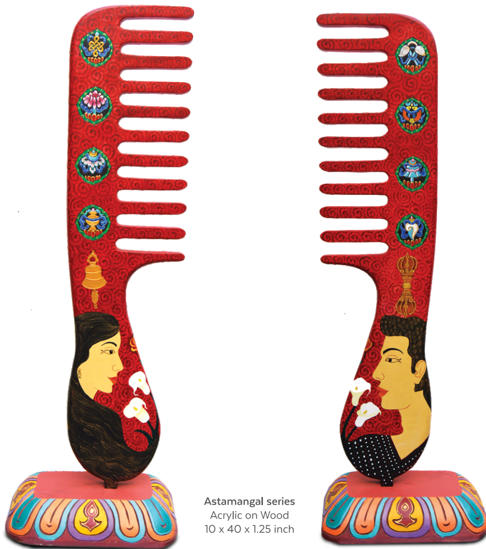
Astamangal series Acrylic on Wood 10 x 40 x 1.25 inch

I mostly use a comb as a central motif in my paintings, Since comb untangles the tangled hair, therefore, in a way it resolves the problem. This is why I have been using a comb as a symbol that solves problems and brings harmony to various entities. I believe positive thinking is always the right way to tackle obstacles consequently helping us to reach our desired destination.