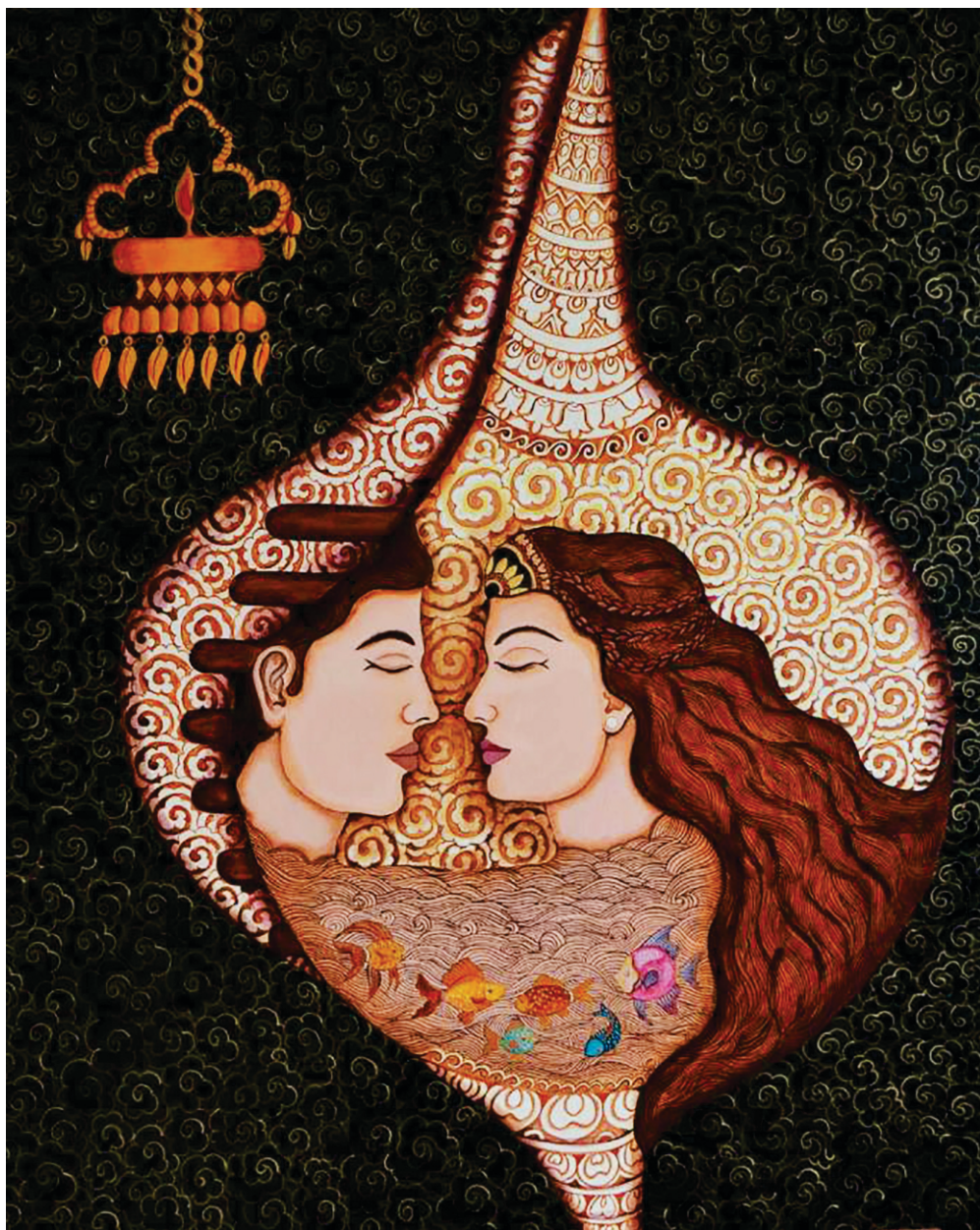
Longitivity Acrylic on canvas 30 x 40 inch