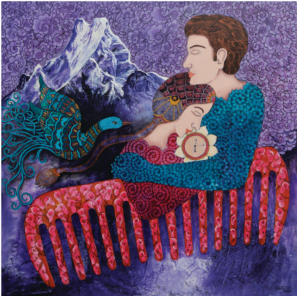
Mountain of love | Acrylic on canvas | 36 x 36 inch