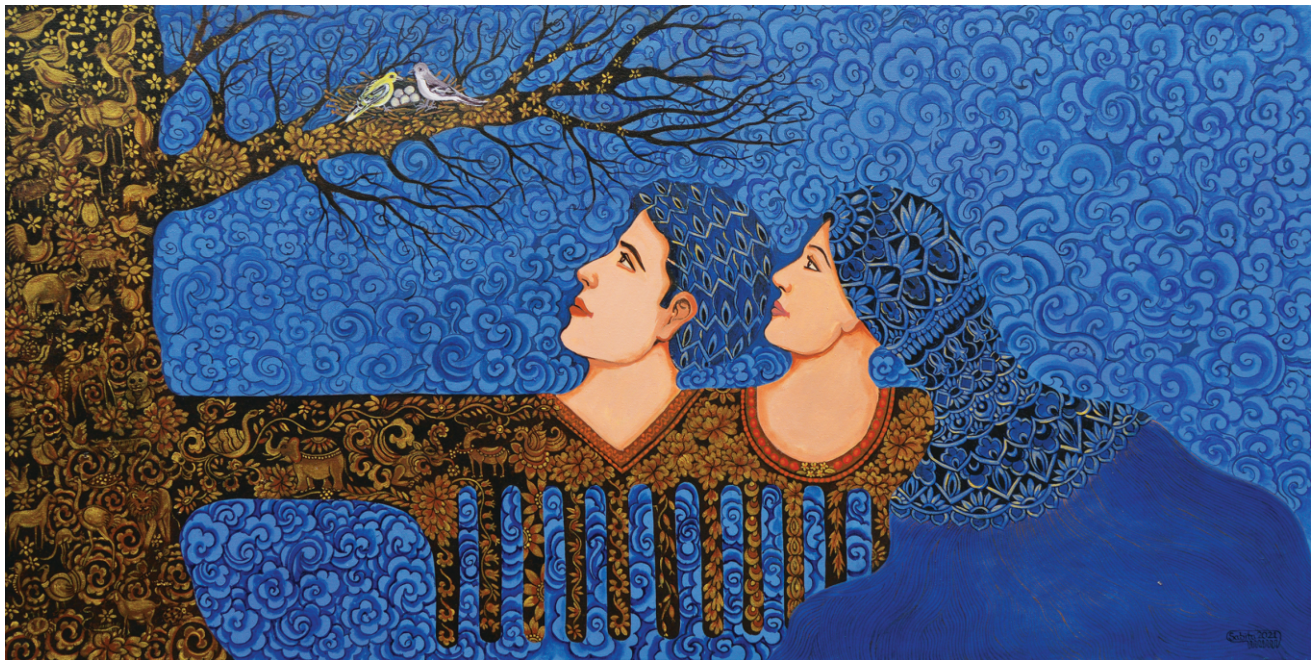
Unconditional love | Acrylic on canvas | 24 x 48 inch