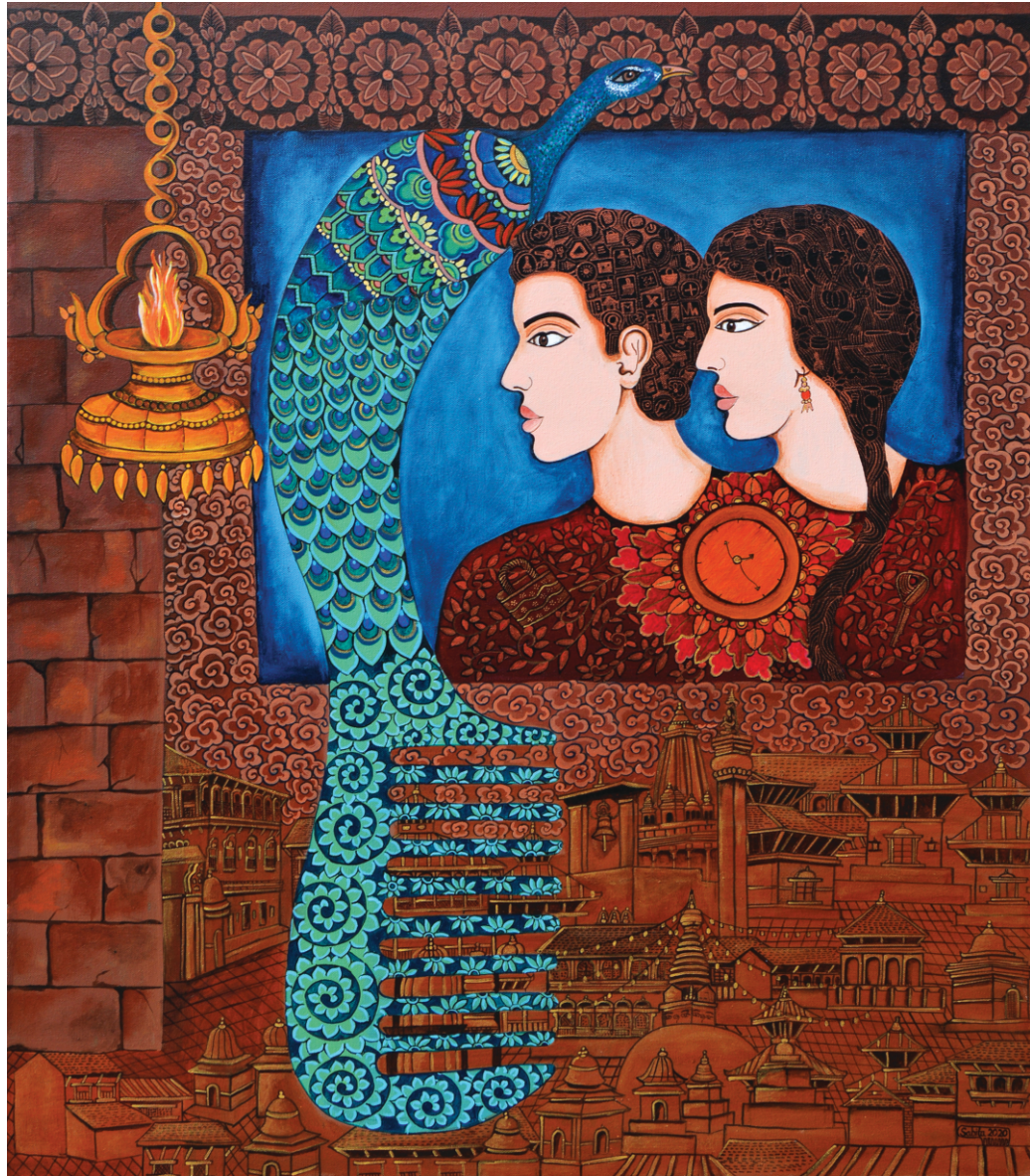
Incarcreation of time | Acrylic on canvas | 30 x 36 inch