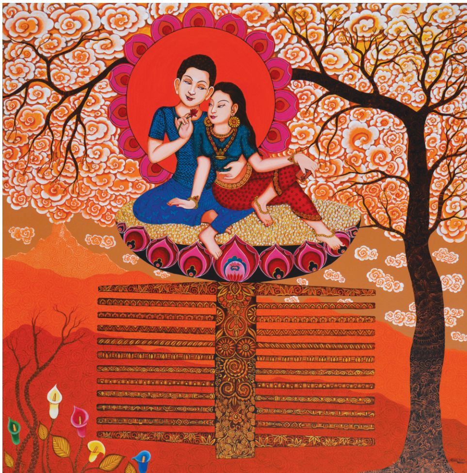
Uma Mahehor | Acrylic on canvas | 72 x 72 inch