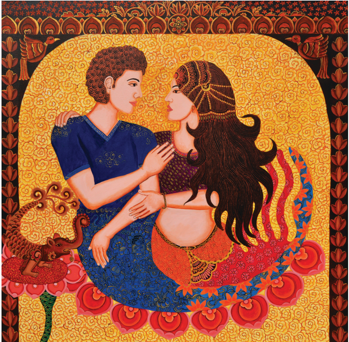
Virtuous love | Acrylic on canvas | 40 x 40 inch