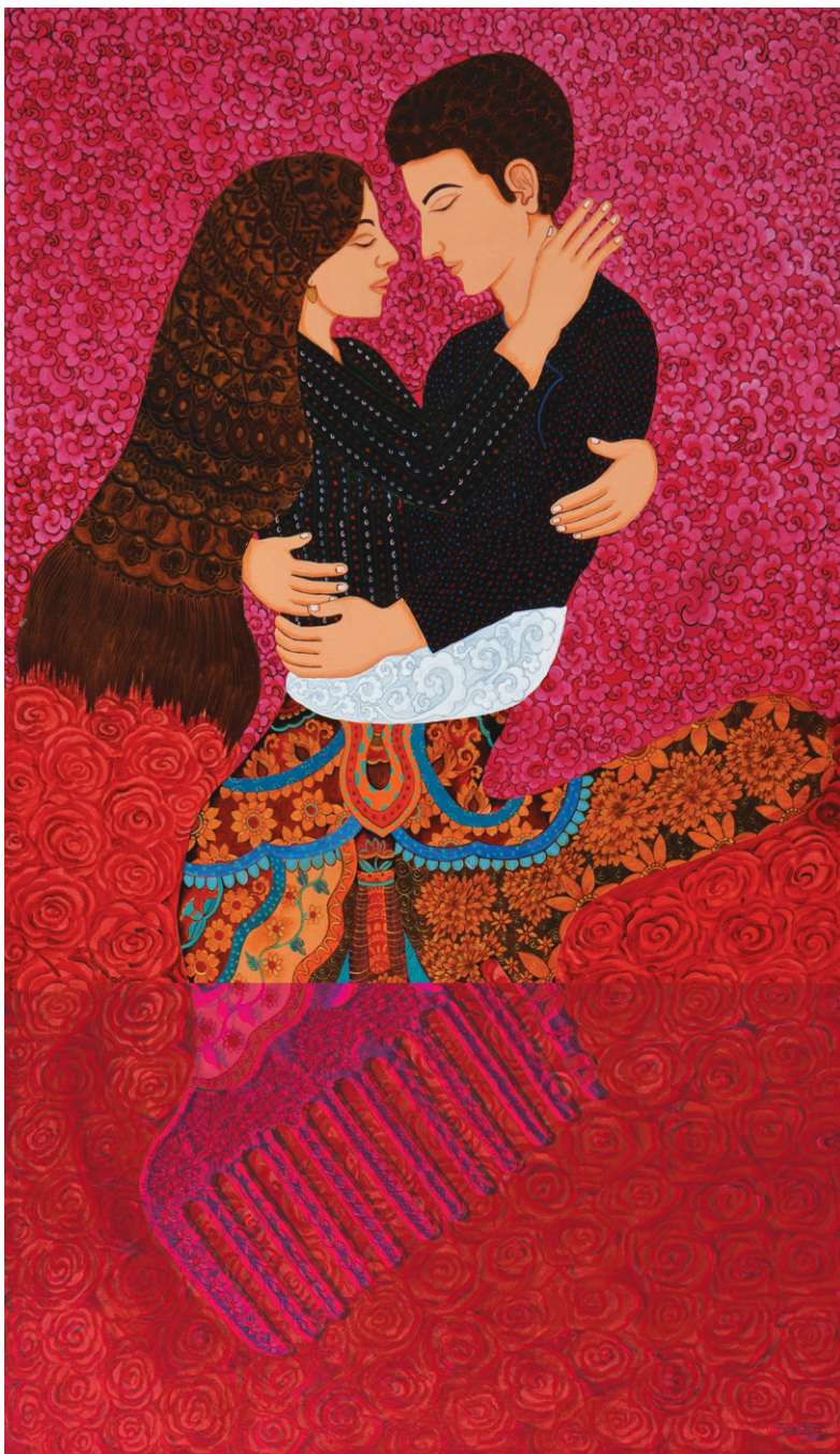
Embrace Acrylic on canvas 36 x 60 inch