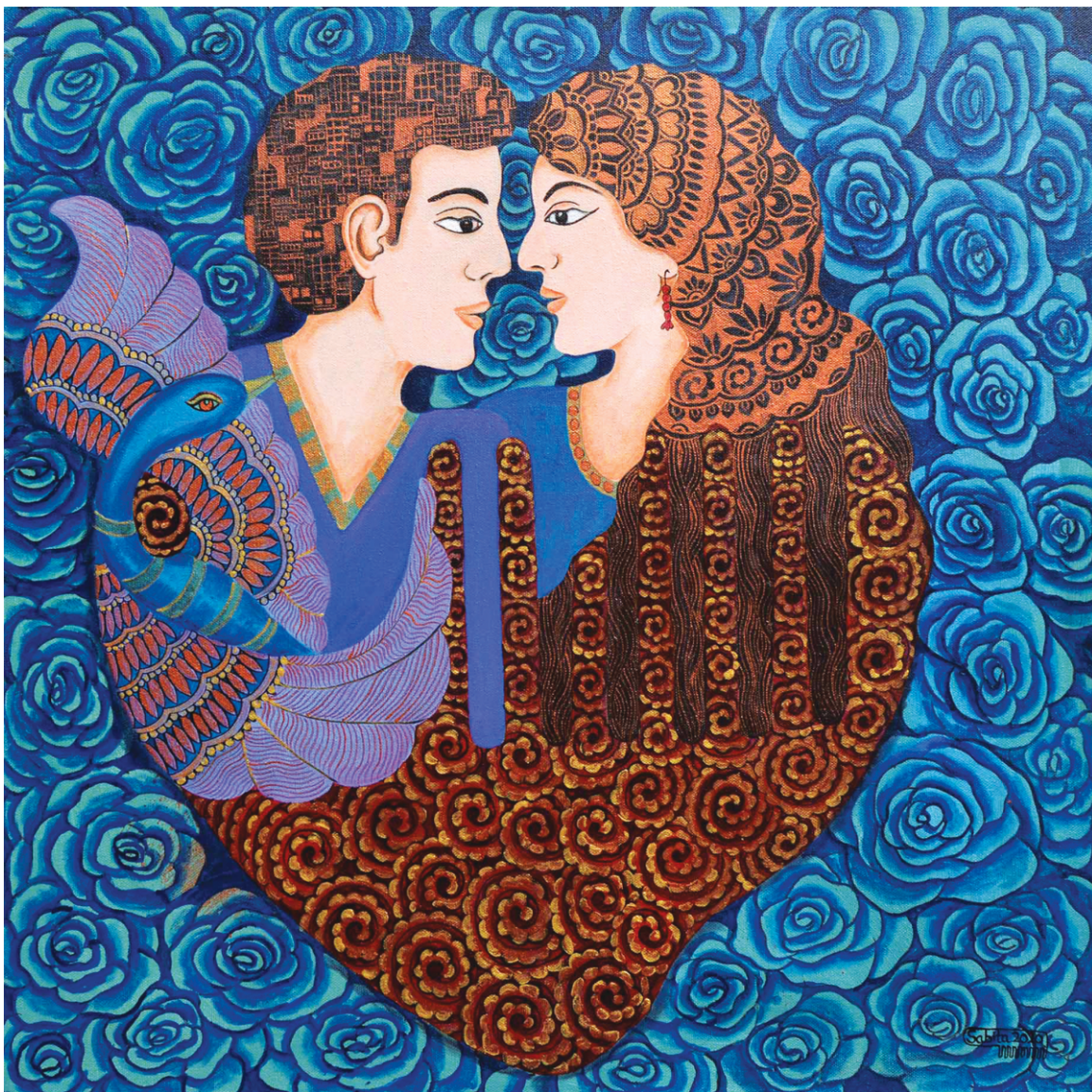
Prosperity of love | Acrylic on canvas | 24 x 24 inch