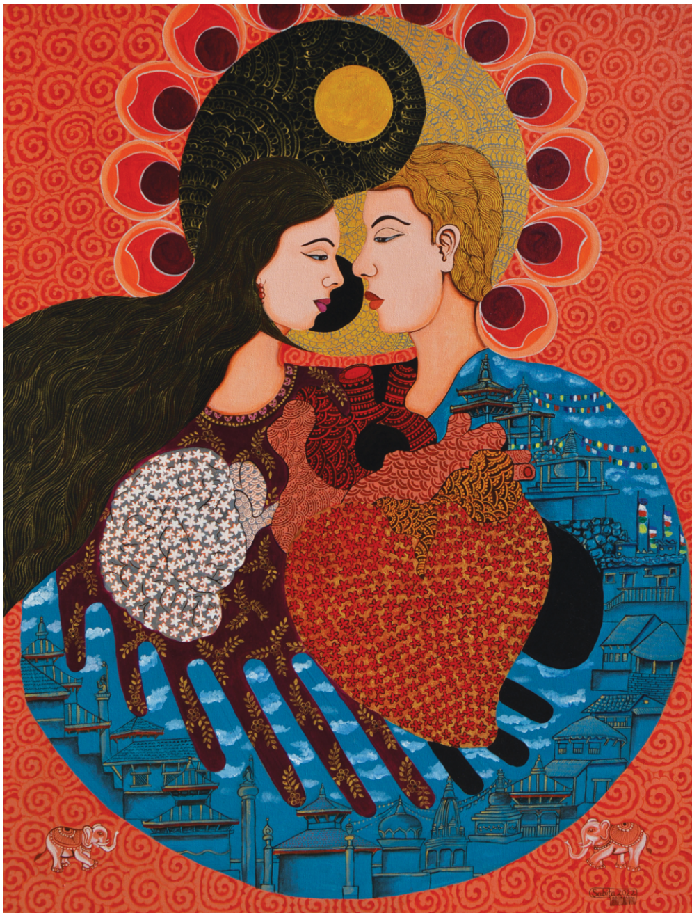
Complimentary thought & emotions Acrylic on canvas 30 x 40 inch