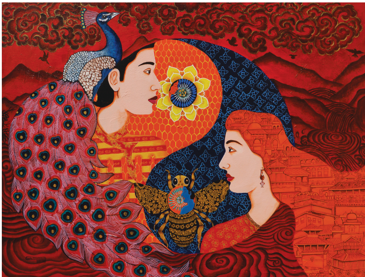
Cosmic thoughts | Acrylic on canvas | 30 x 40 inch