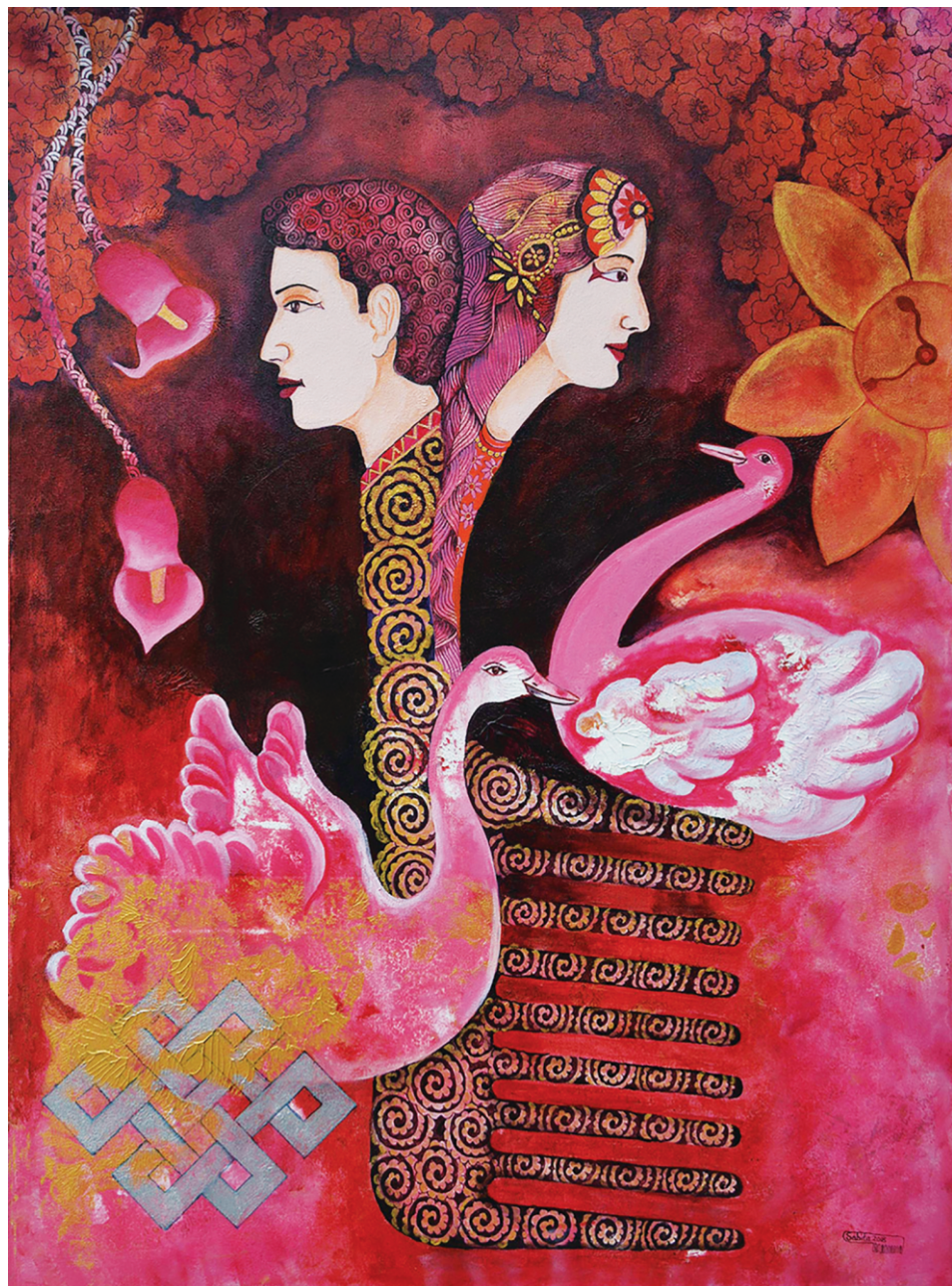
Endless passion Acrylic on canvas 30 x 40 inch