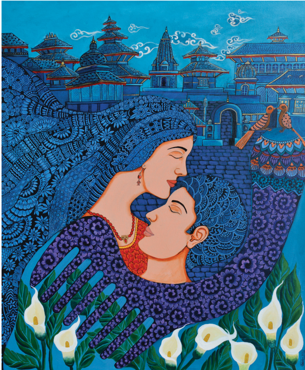
Frankness of hope | Acrylic on canvas | 28 x 34 inch