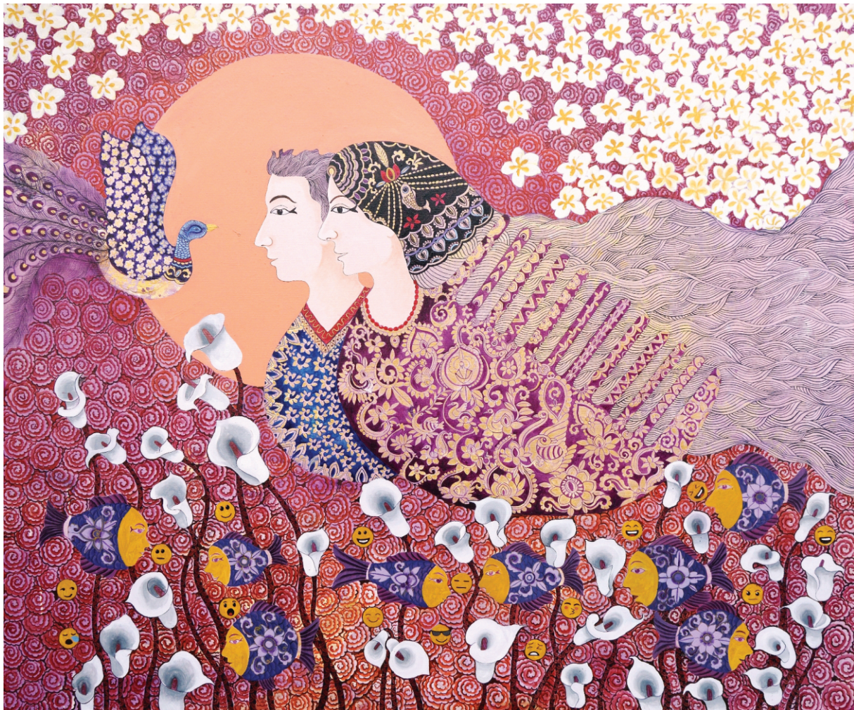
Audacious amicable | Acrylic on canvas | 60 x 48 inch