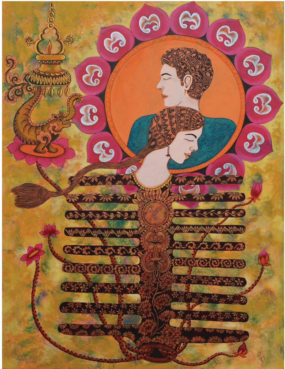
Unconditional Hug Acrylic on canvas 30 x 40 inch