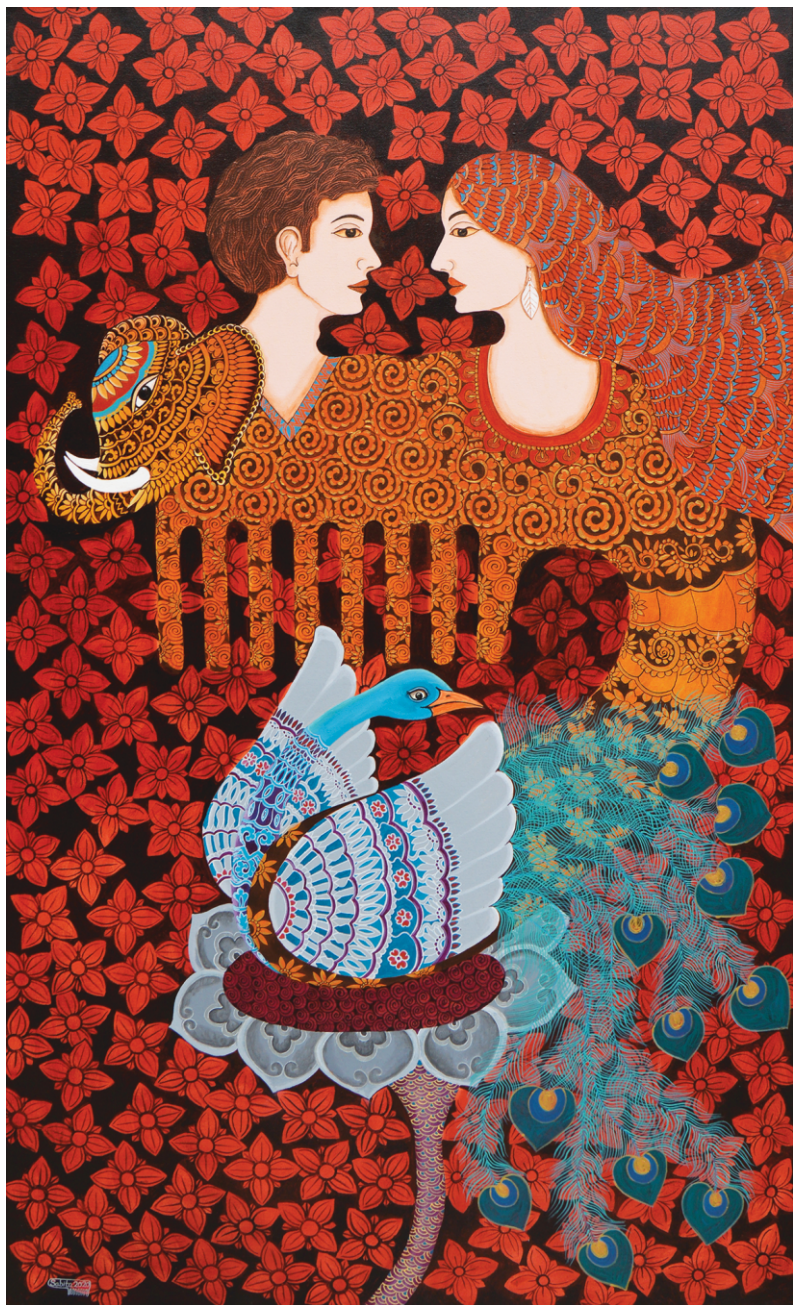
Biological love Acrylic on canvas 36 x 60 inch